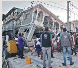
ADRA responds to the 7.2 magnitude earthquake in Haiti