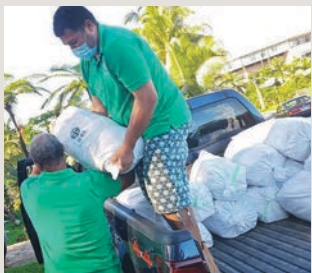
ADRA distributes food to those affected by COVID-19 in Fiji