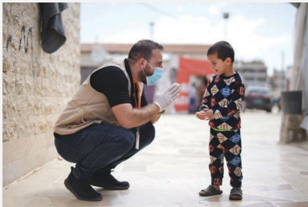
The Emergency Action Alliance launched on August 6

“We at ADRA are very pleased to join the Emergency Action Alliance as one of the founding