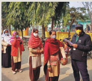
Community members line up to receive vaccinations in India