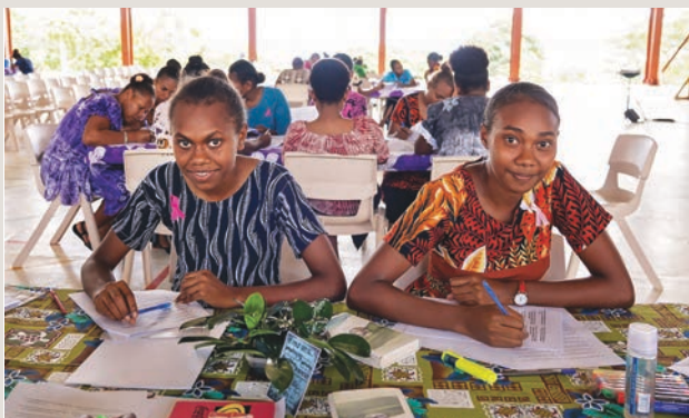
Young women in Vanuatu take part in the 'Young Women Enrichment' Workshops