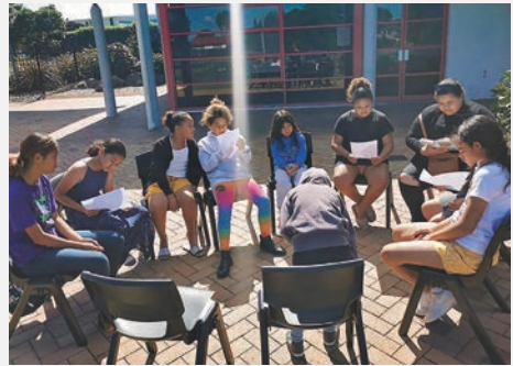
Tahi Whanau Program