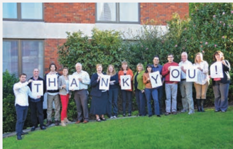
ADRA Australia staff photo, 2012

long-term development initiatives, therefore it changed its name to the Seventh-day Adventist World Service in 1973.