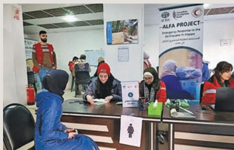
A woman registers to receive assistance in Aleppo

evolved from emergency aid to long-term rehabilitation, including the rehabilitation of school buildings and water systems.”