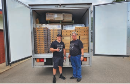
ADRA and church volunteers distribute hampers in response to Cyclone Jasper