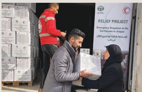
Relief packages distributed in Aleppo