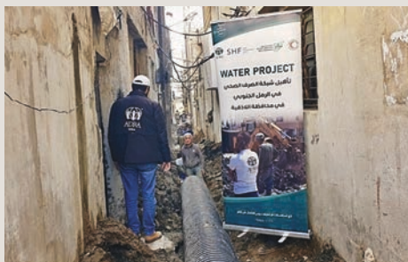
Repair of the water network