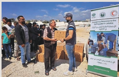
Families in Latakia receive food parcels