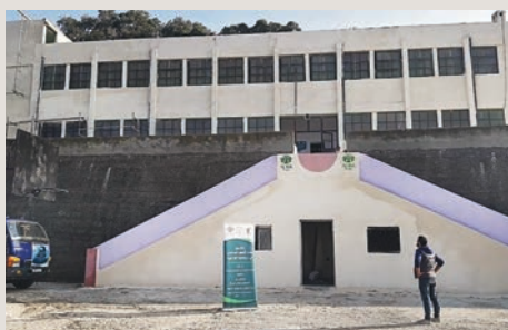
The school after rehabilitation

One example is of a school in rural Latakia. In October 2023, ADRA completed reconstruction of the school, benefiting 1,125 students. One student, Ilizabith*, 9, explains how the disaster affected students.