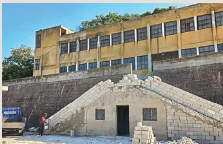
The school before rehabilitation