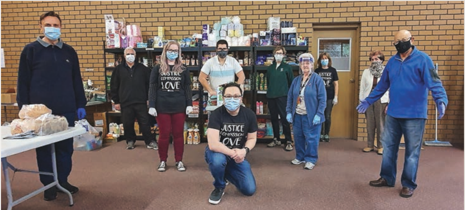
The volunteers from the ADRA Community Care Centre in Wantirna