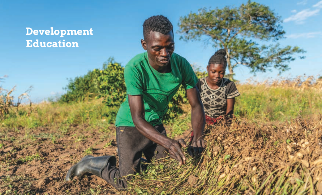
The FARMS Project in Zambia is an ANCP Project