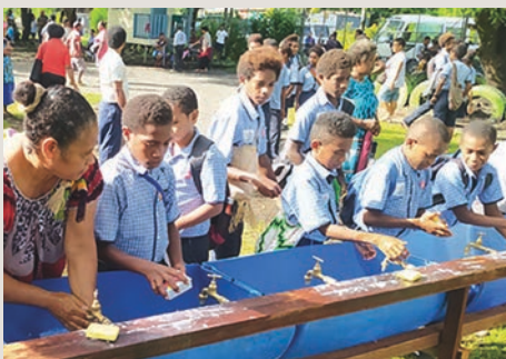
Hand washing at Lae Adventist Primary School