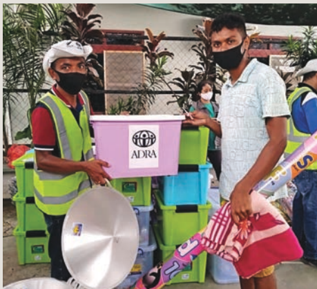
Collecting a kitchen kit