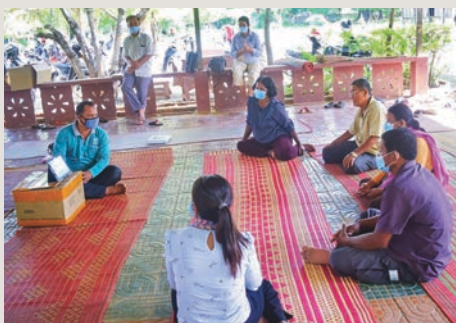
Group COVID-19 training in Cambodia

neighbouring countries around the world who are ill-equipped to face the pandemic. This campaign recognised that COVID isn't over for anyone until it's over for everyone.