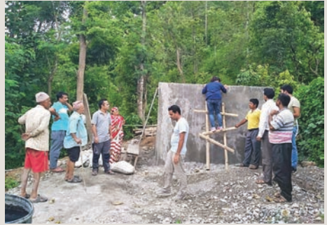
The water tank outlet in the community, connected to the solar powered irrigation pump