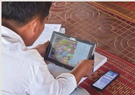
COVID-19 training tablet in Cambodia

End COVID For All: ADRA Australia supported the End COVID For All (ECFA) Campaign by encouraging our supporters to sign a pledge calling on our Government to help our