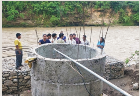
Connecting the solar powered irrigation pump to the water source

Now, there is abundant water for drinking, sanitation and for growing crops to eat, with enough left over to sell at the local markets. This transformative change is all sustained by the power of the sun and Vincenzina's thoughtful gift.