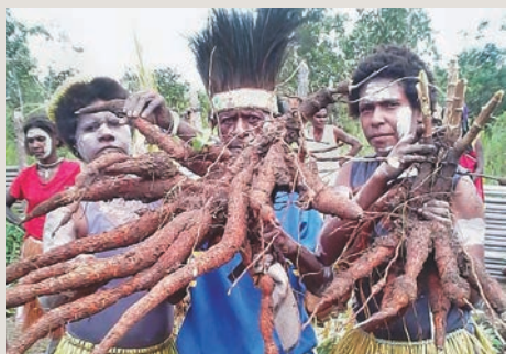
Taro from the recent harvest

ADRA was already doing work in PNG through the CAN DO* Disaster READY Program, helping communities to prepare for rapid and slow-onset disasters. In addition, the Early Action Plan was created and implemented over the course of the