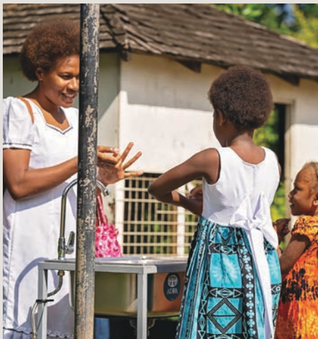
Sinks installed in churches in Vanuatu

Dandenong Polish-Australian Seventh-day Adventist Church.