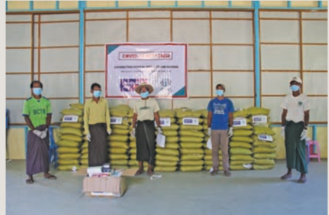
Getting ready to distribute rice bags in Lungngo Village

Posters and pamphlets educating and raising awareness on how to prevent the virus were also